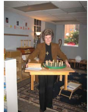
Each Sunday, Catechesis teachers, volunteers and children move atrium materials