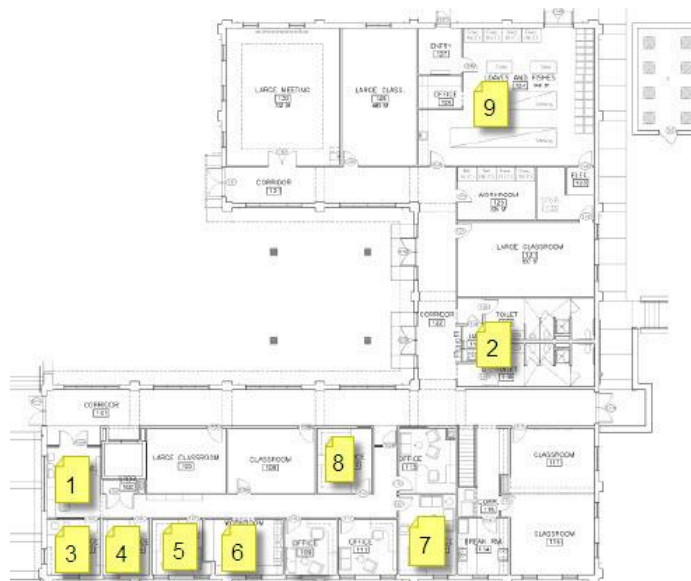
Main Level of the Van Every Building