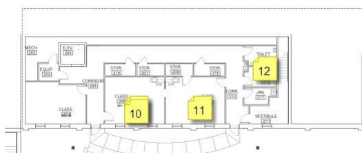
Lower Level of the Van Every Building

PLEASE be aware that there are no functioning bathrooms on